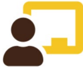
Learning Assistant Program