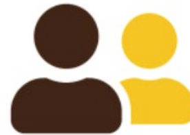
Peer Academic Success Coaching