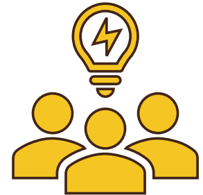
Peer Navigator Program