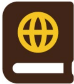
Course Assistant Program

Student Success Services (S3) provides comprehensive academic support programs and connects students to resources to achieve their academic and personal goals.