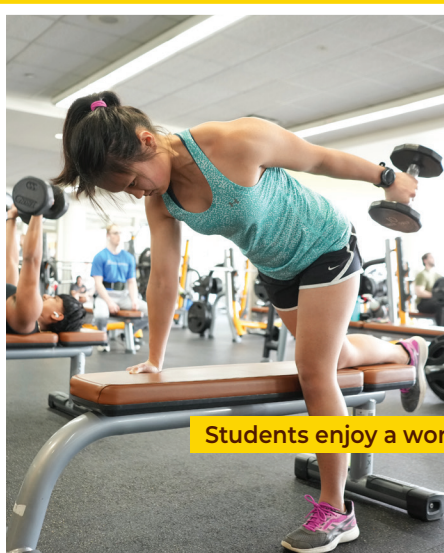
Students enjoy a workout at the recreation center.