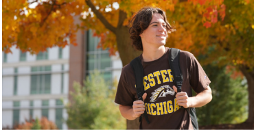
Fall Application Deadline MAY 1

*Tuition varies based on program of study.