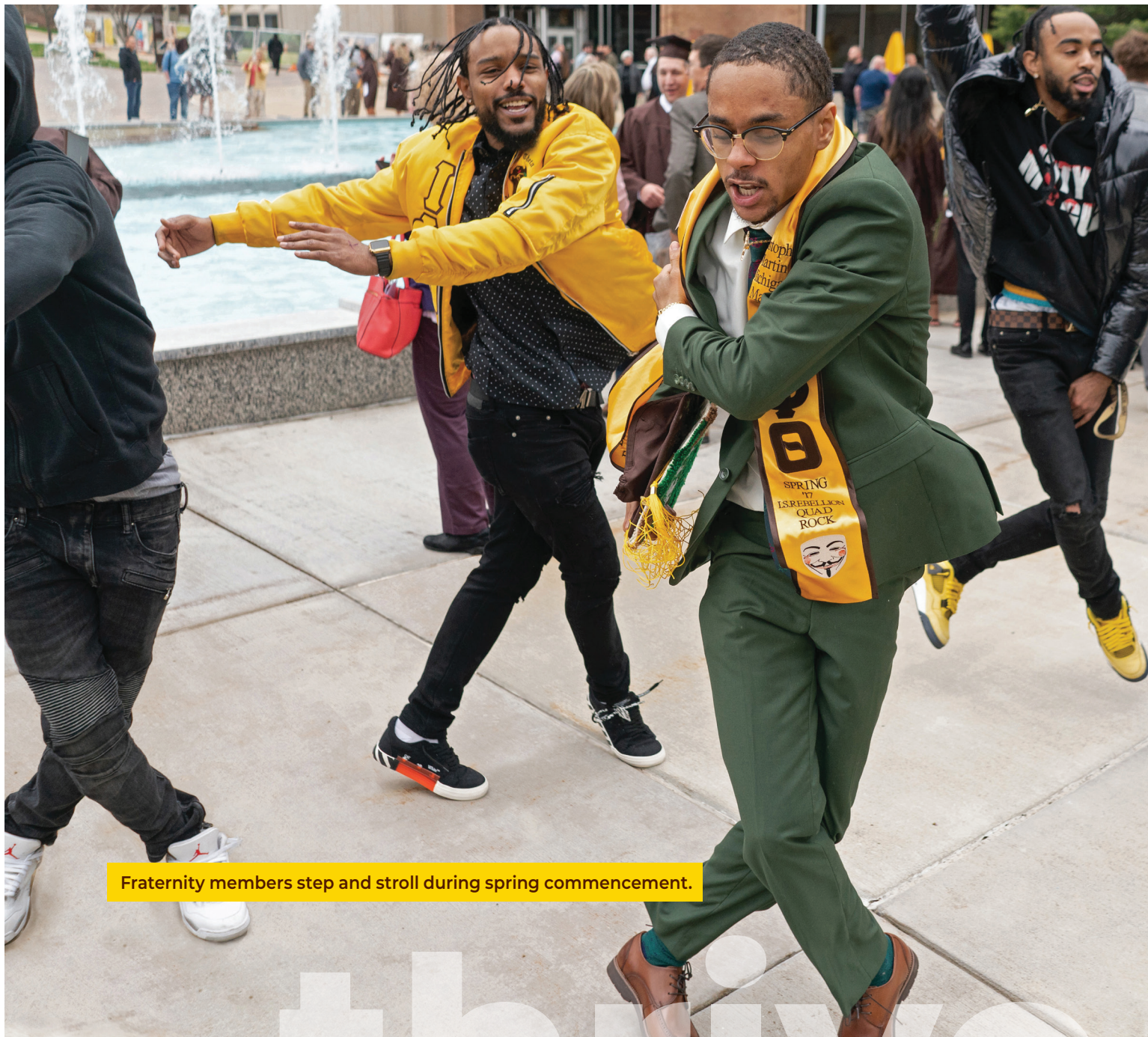
Fraternity members step and stroll during spring commencement.