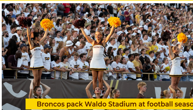
Broncos pack Waldo Stadium at football season.