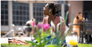
Spring Application Deadline SEPTEMBER 1