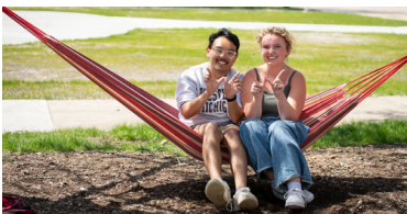
Summer Application Deadline FEBRUARY 1

If you are in need of a U.S. visa, it is strongly recommended to submit your completed application at least 6 months in advance . The Aviation Flight Science program is fall entry only. First-year students interested in the Aviation Flight Science must apply by Dec. 15; transfer students must apply by Feb. 15.