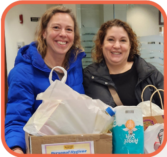
Donation drive supporting WMU Essential Need.

We serve campus and community partners with responsive, tailored programs, meeting needs not filled by other sources in the community.